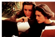
Manage centrally and broadcast to multiple locations instantly