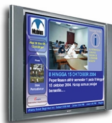
Display via monitors, televisions, projectors.

Newscast was designed to operate on local area networks or intranets. As such, multiple display locations can be setup to display content from a single server.